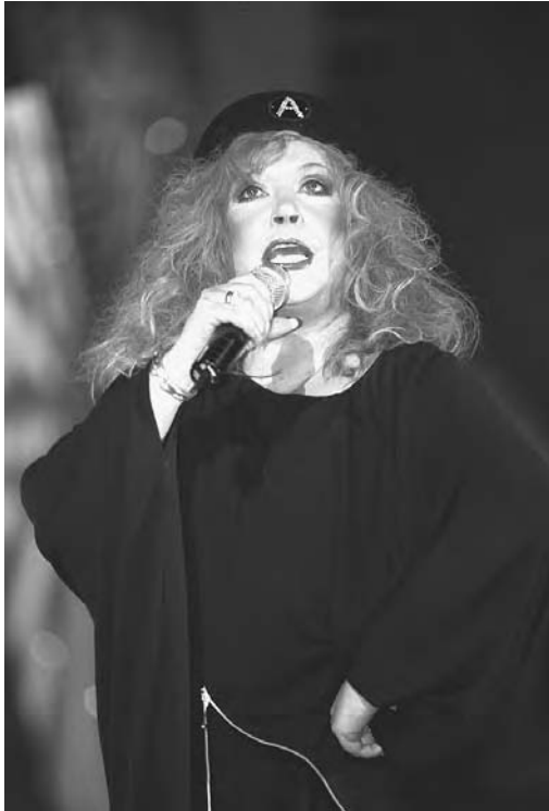
Alla Pugacheva, the Soviet pop legend, performing her hit “Harlequin” in the costume designed for her theatrical performance of this 1970s hit.

to song, varying her intonation, changing costumes, and altering the pitch of her voice to match the mood of the song. Most of Pugacheva’s songs of the 1970s and 1980s were composed by the team of Raimond Pauls and Ilia Reznik, who wrote the hit “Yellow Leaves” (Zheltые list’ia, 1978). Although the heyday of her career was clearly in the late 1970s, Pugacheva continues to make the headlines, whether it is with her marriage to the much younger pop star Filipp Kirkorov, or the launch of a shoe and fashion label, or the participation in 1997 in the Eurovision Song Contest with “Primadonna,” where she came in only fifteenth.