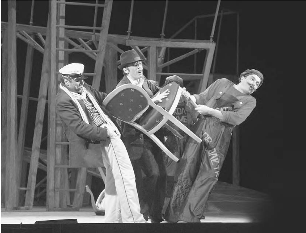
Scene from the musical Twelve Chairs , which opened in Moscow in 2003. Ostap Bender (left) is seen trying to inspect one of the chairs for the hidden treasure.

sually—in the use of an orange backdrop for the sunrise and the city waking, or the use of kitchen tools to characterize the hostel—is reminiscent of Nord-Ost , as are the red stars of the Kremlin appearing from on high.