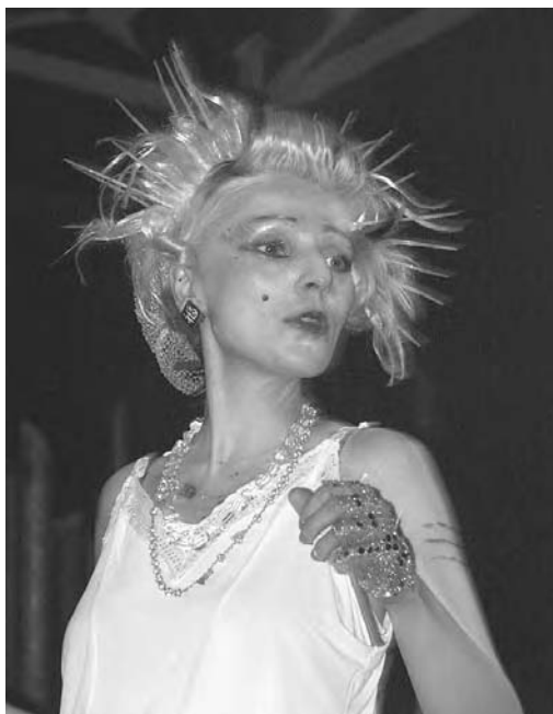
Zhanna Aguzarova, the stunning performer who has always sought new ways to outrage and shock her audiences.

from the others because of his behavior and his appearance (he has one earring). He is juxtaposed to the “Soviet” official Krymov, played by the documentary filmmaker Stanislav Govorukhin—a representative of the establishment—who holds power over his mistress Alike (Tatiana Drubich). He may possess the power to have Bananan killed, but Alike becomes aware of the plot and kills Krymov. Bananan is a romantic hero, who triumphs—even if in death. In the finale a concert by Viktor Tsoy takes place against all the rules and regulations, and the song “I Want Change” (Ia khochu peremen) expresses dissatisfaction with a world where happiness is possible only through escapism into a dream world.