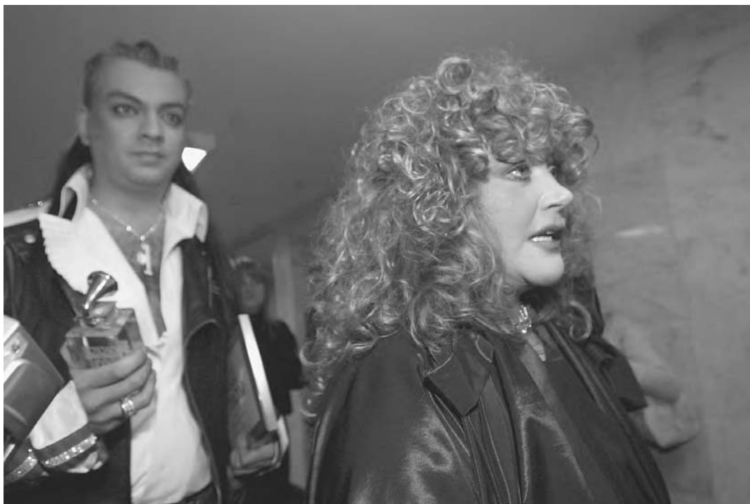
Russian pop diva Alla Pugacheva (right) and her husband Filipp Kirkorov (left) arrive at the Kremlin Congress Palace to attend the Eighth Golden Gramophone Awards ceremony, 2003.

Vladimir Presniakov could hardly have missed the rock movement that was so strongly represented in the town. After a stint in a hard rock group, his voice broke, and he turned to modern jazz and break dancing. With his falsetto voice, he soon launched a solo career. Presniakov's liaison with Pugacheva's daughter, the actress and occasional singer Kristina Orbakaite, with whom he has a son, provided mundane stuff for the tabloids.