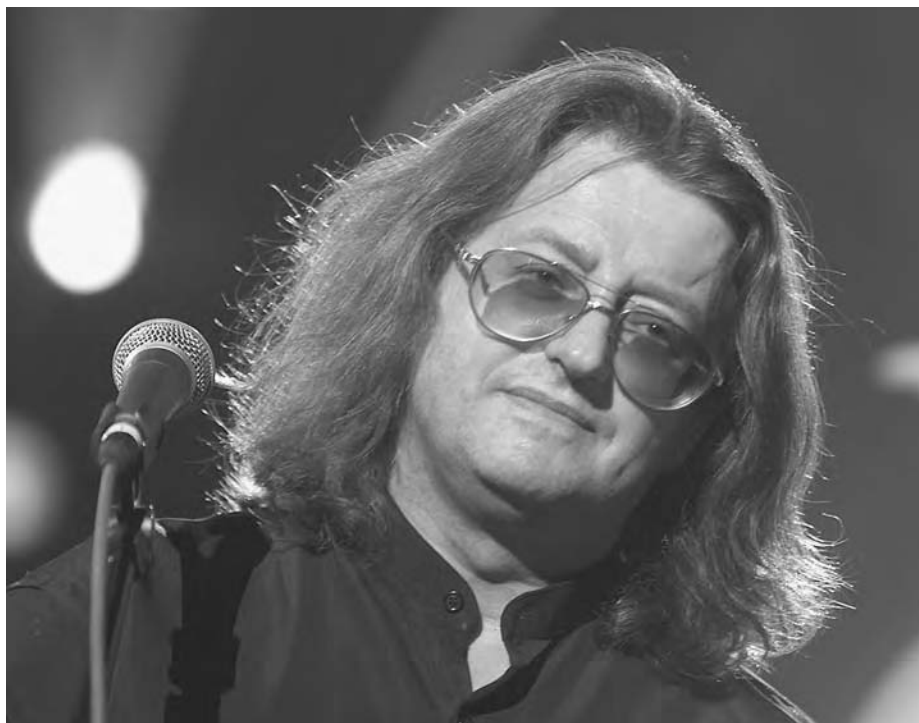
Alexander Gradsky performs during his concert at the Central Concert Hall Rossiya, 2001.

saxophonist Alexei Kozlov (b. 1935). The band had performed jazz and rock music in the Molodezhnoye Café before Kozlov joined a band with Yuri Saulsky. The group continues to play to the present day, but now at the Moscow Philharmonic with a classical repertoire, providing another example of the gradual acceptance of jazz music into official culture. The composer Alexei Rybnikov (b. 1945) created the rock opera The Death and Radiance of Joaquin Murietta , based on Pablo Neruda's play, staged at the Moscow Theater of the Lenin Komsomol in the 1970s. His rock opera Perchance , based on the long poem by Andrei Voznesensky, created the megahit "I Will Never Forget You" (Ia tebia nikogda ne zabudu).