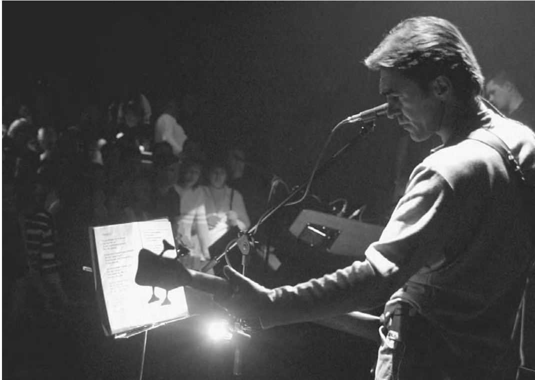
Viacheslav Butusov with his new band Ju-Piter performing on the stage of the B-2 Club in Moscow in 2004.

band, they were recorded by Butusov with free-lance musicians. A genuine experimenter, Butusov continues to compose music and has collaborated with the band DeadUshki (literally “dead ears,” or phonetically “dedushki,” grandfathers, formed in 1998), which creates electronic music. Butusov features prominently in Alexei Balabanov’s blockbuster Brother , where the opening of the film captures the hero stumbling onto the set where the clip “Wings” (Kryl’ia) is being shot. He gets beaten up and continues his search for the latest album of “Nau” throughout the film, at one point accidentally walking into a party at Butusov’s flat. The song explores the fragility of the human soul but uses the image of wings that allow man to fly and that have been removed from man’s back,