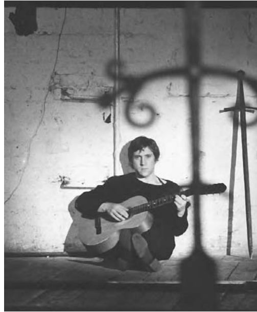
Vladimir Vysotsky, actor and bard, reciting Boris Pasternak's poem "Hamlet" to the guitar at the beginning of Hamlet, directed at the Taganka Theater by Yuri Liubimov in 1971.

Many of these bard songs were critical of the heroic manner with which Soviet historiography dealt with the victory in World War II, ignoring the sacrifice of the individual to achieve that victory. Others dealt with the horror of the Stalin era (still much of a taboo despite the 20th Party Congress and Khrushchev's Secret Speech on Stalin's