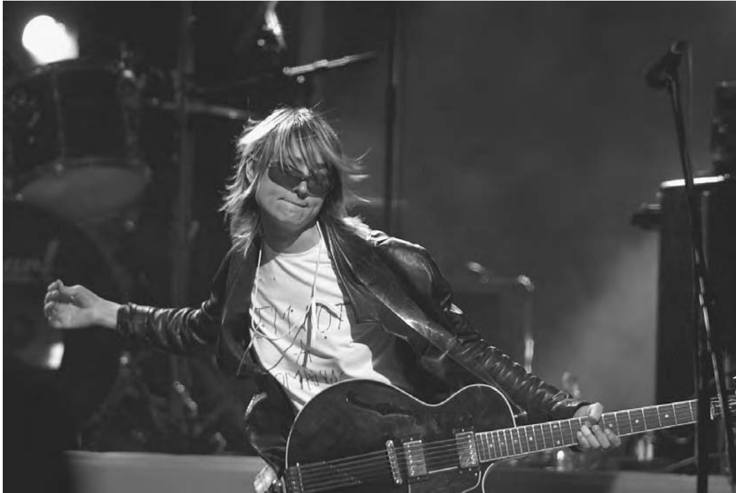
The rock singer Zemfira performs at the Maxidrom rock festival in the Olympic Sports Complex in 2002.

The most innovative new talent is that of Natasha Ionova, but she has conquered the charts not with her voice, but by the creation of her puppet personality. The 17-year-old Natasha, who performs as the band Gliukoza (original spelling ГЛЮКЪ:ЗА where gliuk means a high and the complete word glucose ), appeared on the stage in 2003. Gliukoza loaded her first composition onto the Internet as mp3 files and then gained popularity with her cartoon figure. She wears a mask of this character for her clips and performances, portraying a girl with blond hair (like her) through her mask.