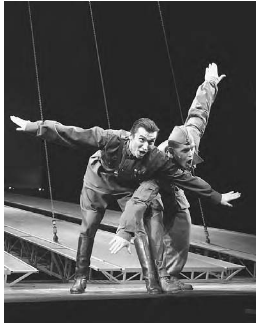
A scene from the musical Nord-Ost , the first Russian musical to open in Moscow at the Dubrovka Theatre in 2001.

Nord-Ost launched a massive publicity campaign in the style of Western musicals. A Web site was created primarily for marketing purposes. It was the first show with