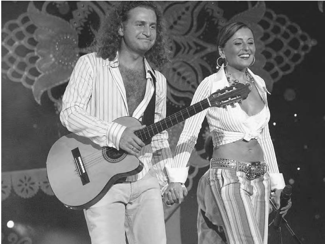
Leonid Agutin with his wife Angelica Varum, performing together.

With the increasing need for a financially strong producer, corporate and private sponsorship has become vital for the Russian pop star scene. Moreover, singers rely on good composers and songwriters to create hits for them. Natasha Koroleva was