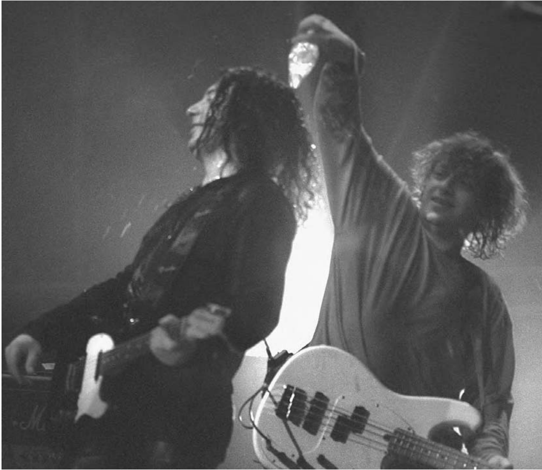
Rock band Agatha Christie performs on the stage of Luzhniki Sports Complex. The 2003 concert marked the band's fifteenth anniversary.