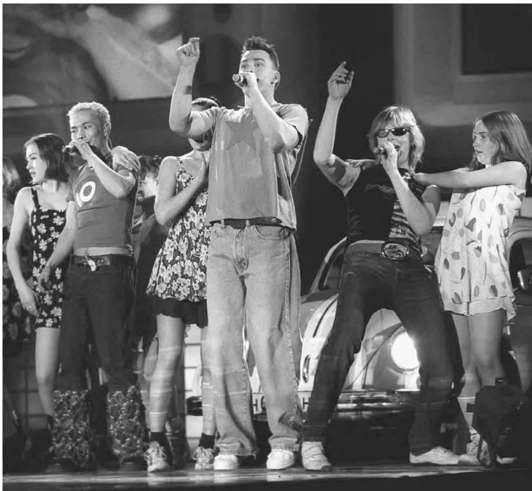
The pop group Ivanushki International performs during the celebration of the group's fifth birthday at the Olympic Sports Center in 2001.

club performances, becoming gradually more melodic and more appealing. They have composed music for the theater and have recorded two albums with Kolibri. The band Chizh and Co. (1993) under Sergei Chigrakov (Chizh) is characterized by his falsetto voice and guitar play. Chizh recorded his first album with support from Petersburg musicians. His songs are autobiographical and deal with contemporary life. Chizh is extremely prolific. His 1997 album Bombers (Bombardirovshchiki), with the song "Tanks Thundered in the Fields"