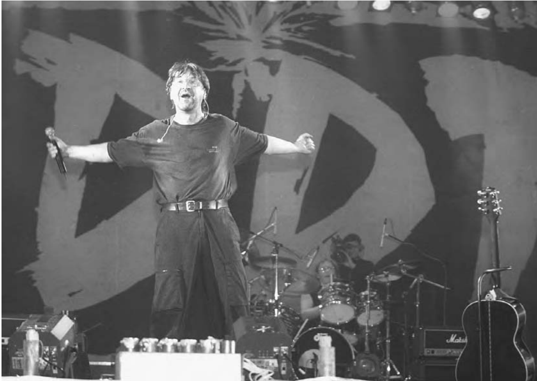
Yuri Shevchuk, leader of the DDT rock group at a jubilee concert of his group at the Olympic Sport Complex, 2000.

new anthem of the rock movement. Shevchuk followed in many ways the traditions of Vysotsky: a concern for social ills, the hoarse and emotionally charged voice, and a love for Russia and her past informed his songs. The album Actress Spring ( Aktrisa vesna , 1992) revealed a mixture of Russian folk and rock styles. As the 1990s moved on, and the need for a voice of opposition gave way to a voice that entertained, Shevchuk became less angry and challenging and more disillusioned with the role of a rock poet in the New Russia. Although DDT continues as a band, he has, in many ways, suffered a fate of marginalization from the mainstream similar to that of Grebenshchikov.