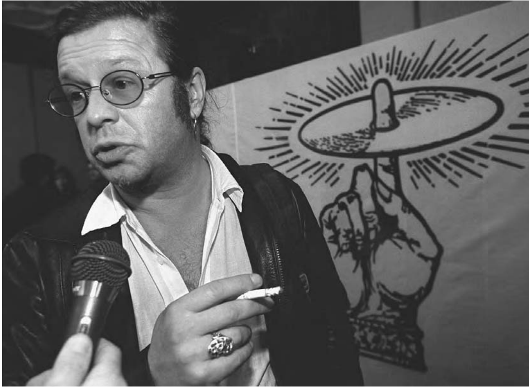
Front man Boris Grebenshchikov of the Aquarium rock band is interviewed at the press conference launching the band's first DVD, 25 Years of Aquarium, at the President Hotel, Moscow, in 2001.

cello. In the late 1970s the influence of Bob Dylan made itself felt, and around 1980 the band had a brief punk phase with dissonant sound. During one rock festival in Tblisi, Grebenshchikov rolled on the floor clutching his guitar while the cellist was standing above him. This was interpreted as a sexual act, and the officials left. After the Tblisi concert, BG was expelled from the Komsomol and lost his job. All the other band members began working in pro forma jobs (night watchmen) but spent their time making music. The band continually sought new ideas and experimented. They attracted several leading sax players for their albums and recorded three albums (1981–1984) with the pianist Sergei