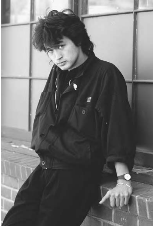
The rock star and actor Viktor Tsoy, whose premature death in 1990 turned him into a genuine rock legend in Russia and abroad.

cess, and Tsoy appeared in the films ASSA and The Needle . The song “Blood Group” accompanied the final scene of The Needle when the knightlike Moro wandered off into the other world, having failed to realize his noble aims in this world. The tune “I Want Change” ended Soloviev’s film ASSA (1988), where the alternative hippie lifestyle represented in the film by the character of Bananan finally triumphs—albeit after Bananan’s destruction by the current, prevailing system—in a semi-forbidden concert. Tsoy died in a car accident while on holiday in the Latvian Baltic Sea resort Jurmala. His premature death turned him into a genuine rock legend in Russia and abroad.