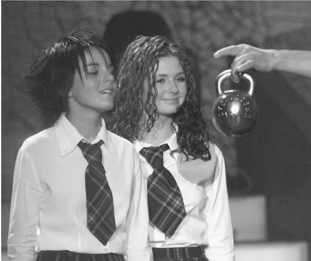
The girl band t.A.T.u takes part in the “Stopudovyi” Hit (Hundred-Pound Hit) Awards ceremony held by Hit-FM radio in the Kremlin Palace, 2001.

present themselves as considered to be mad by others and in need of a cure. The clips illustrated the girls’ feelings for each other, and their entrapment in a society from which they sought to escape.