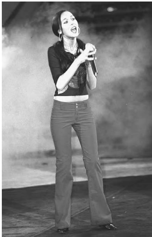
Alsou, the talented singer who represented Russia in the 2000 Eurovision Song Contest.

Zemfira (Ramazanova) was discovered in 1998 at a rock festival in Moscow and was helped in her career by Ilia Lagutenko of Mumii Troll for her first album. SPID (Aids) became an instant hit and was played frequently on radio. Zemfira’s individual man-